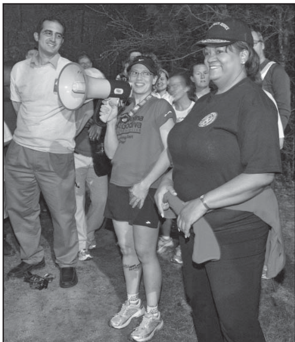
The US Surgeon General, Dr. Regina Benjamin, led 200 people on a walk on the ECG in Durham, NC