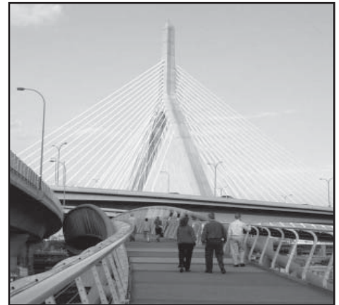
Celebrating the ECG's 20th Anniversary in Boston with a walk on the new North Bank Bridge.